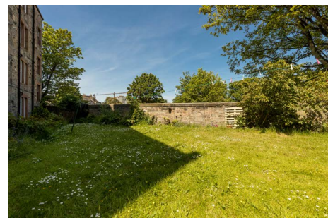
45 F7 Albion Road. Edinburah Midlothian, EH7 5QP